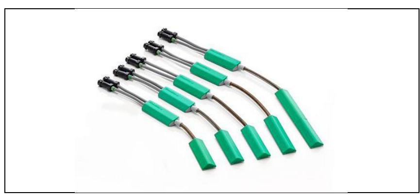
Figure 5: Biometrics SG Series goniometer offerings.

The example pictured above serves to illustrate common techniques that researchers employ when using goniometer type devices. Each situation and use-case is unique, however, so the User is encouraged to explore other strategies as needed.